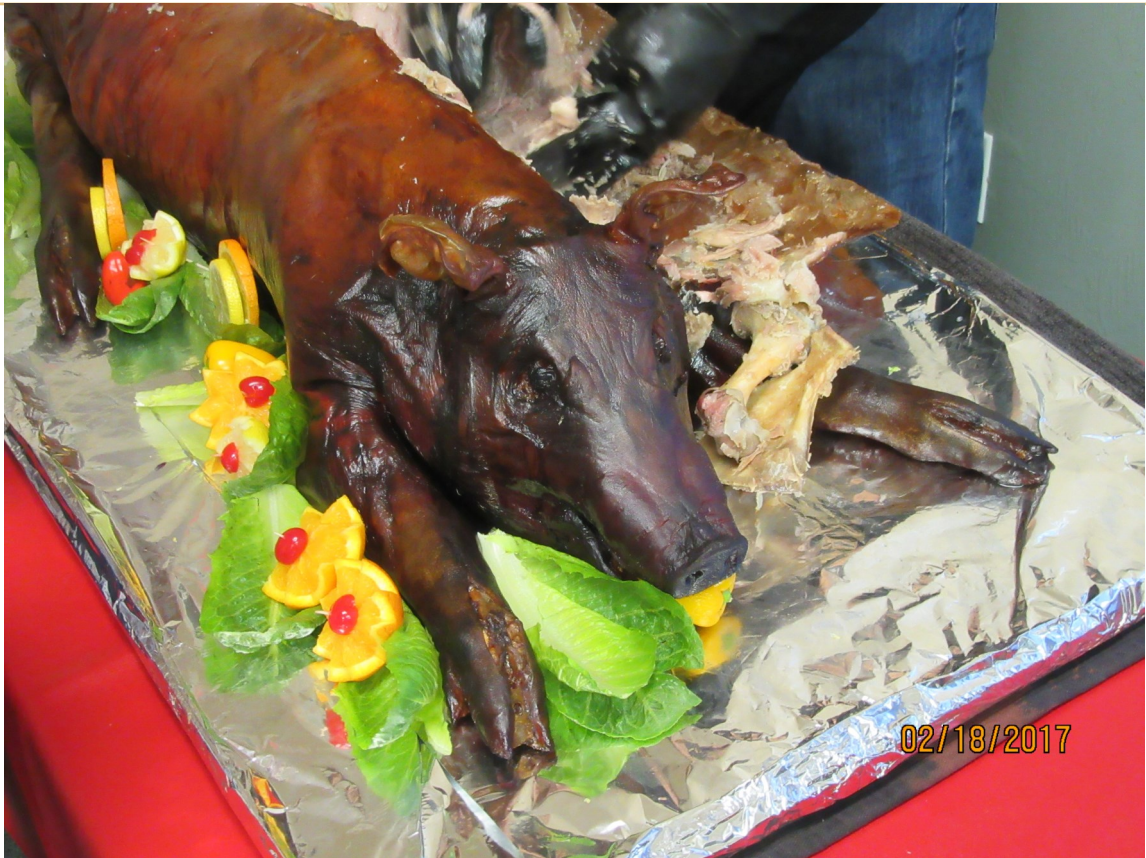
The Star himself